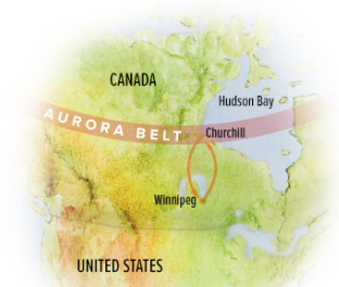
Click here to see why Churchill is the best place on the planet to view the Northern Lights

Our northern lights photo expedition begins in Winnipeg, the capitol of Manitoba. Once a fur-trading hub and later a Canadian Pacific Railway boomtown, today Winnipeg is a vibrant cultural and commercial center on the eastern edge of Canada’s vast prairies. On arrival, you are met and transferred to the distinguished Fort Garry Hotel, one of the city’s most prestigious landmarks. Built in 1913 by the Grand Trunk Pacific Railway in the style of a French chateau, it remains the grande dame of Winnipeg hospitality.